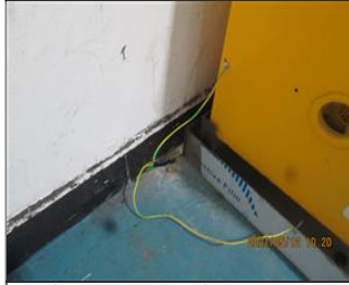
Photo of chemical storage room (if applicable) Electrostatic grounding was available.JPG