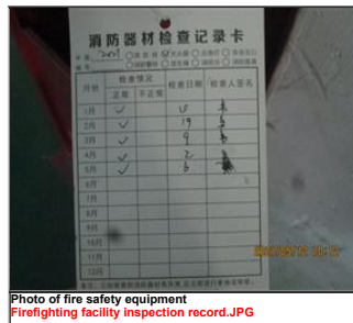
Photo of fire safety equipment Firefighting facility inspection record.JPG