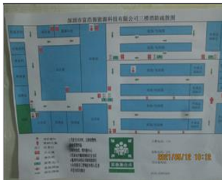
Photo of fire safety equipment Evacuation map.JPG