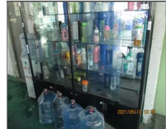
Photo of the sanitary facilities Potable water.JPG