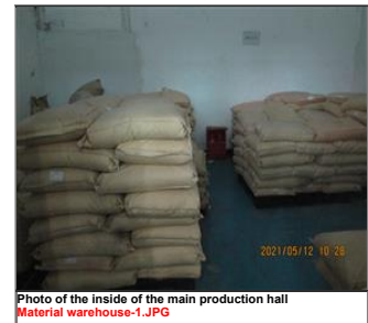
Photo of the inside of the main production hall Material warehouse-1.JPG