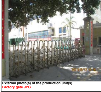
External photo(s) of the production unit(s) Factory gate.JPG