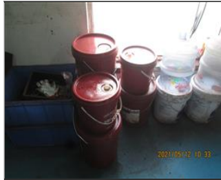
Photo of non-conformity 8 barrels of lubricating oil in injection molding workshop were not equipped with secondary contains.JPG