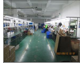
Photo of the inside of the main production hall Packing.JPG