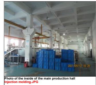
Photo of the inside of the main production hall injection molding.JPG