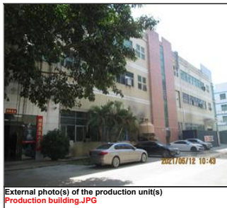
External photo(s) of the production unit(s) Production building.JPG