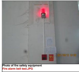
Photo of fire safety equipment Fire alarm bell test.JPG