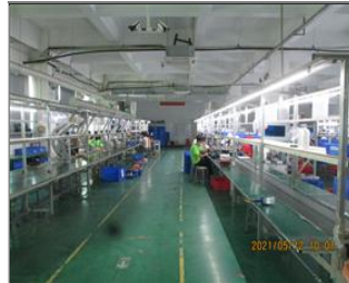
Photo of the inside of the main production hall Assembly.JPG