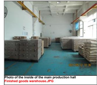
Photo of the inside of the main production hall Finished goods warehouse.JPG