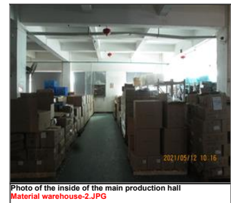
Photo of the inside of the main production hall Material warehouse-2.JPG