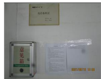
Photo of the inside of the main production hall Suggestion box.JPG