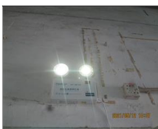
Photo of fire safety equipment Emergency light test.JPG