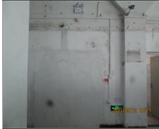
Photo of fire safety equipment Evacuation indicating sign and emergency light in workshop.JPG