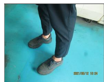
Photo of the personal protection equipments (if applicable) Metal shoes were provided to molding workers.JPG