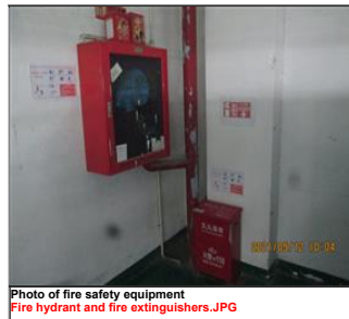
Photo of fire safety equipment Fire hydrant and fire extinguishers.JPG