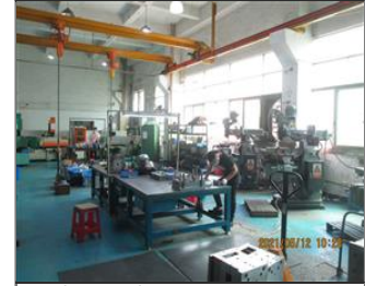
Photo of the inside of the main production hall Molding.JPG