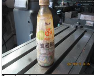
Photo of non-conformity 3 bottles of anti-rust oil in molding workshop were not posted effective label.JPG