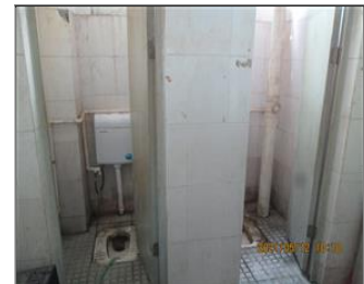
Photo of the sanitary facilities Toilet.JPG