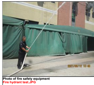
Photo of fire safety equipment Fire hydrant test.JPG