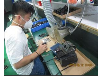
Photo of the personal protection equipments (if applicable) Tin soldering workers wore dustproof mask.JPG