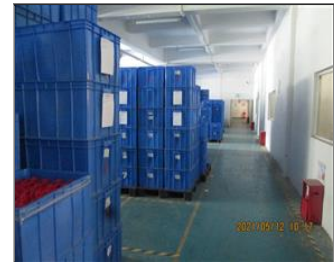
Photo of the inside of the main production hall Semi-finished goods warehouse.JPG