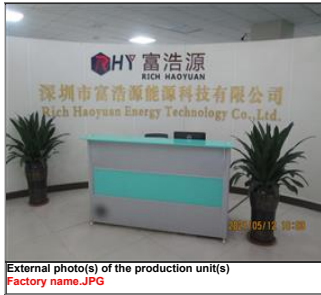
External photo(s) of the production unit(s) Factory name.JPG