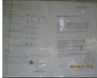
Photo of the code of conduct on display amfori BSCI code was posted.JPG