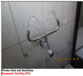
Photo first aid facilities Eyewash facility.JPG