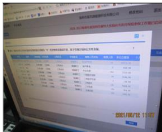
Photo of non-conformity the main addtee did not provide social insurance for workers as per legal requirement.JPG