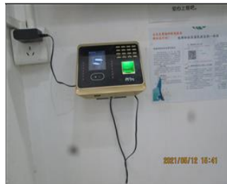
Photo of the inside of the main production hall Attendance recorder.JPG