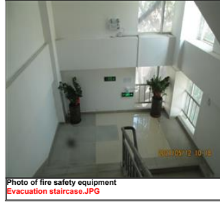
Photo of fire safety equipment Evacuation staircase.JPG