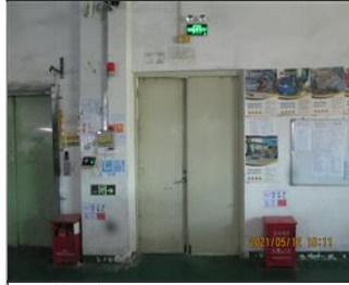
Photo of fire safety equipment Safety exit sign and emergency light.JPG