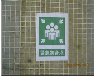
Photo of fire safety equipment Emergency assembly point.JPG