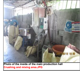
Photo of the inside of the main production hall Crushing and mixing area.JPG