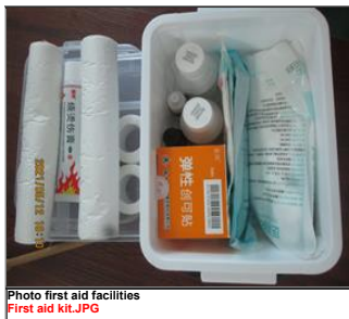
Photo first aid facilities First aid kit.JPG