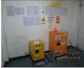
Photo of chemical storage room (if applicable) Chemical warehouse.JPG